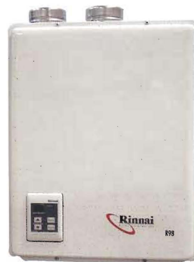
R98i Model Series Shown With Standard Integrated Control